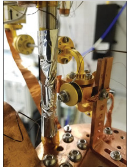
The Schuster Lab at the University of Chicago conducts experiments at temperatures near absolute zero (1 Kelvin). At the extremely high frequencies used in this setup, their work required a specialized cryogenic isolator from Micro Harmonics that did not over-rotate the field and create unwanted issues.

unwanted waves reflect back into the transmitter to attenuate power output while raising unwanted noise input. Especially in the MMW bands that cover the frequencies between 30 GHz and 500 GHz, the reduction of transmitted signal strength jeopardizes the battle — almost literally in military applications.