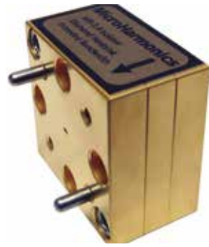
A Micro Harmonics FR34 isolator.

"They fully characterize each individual isolator, which is really important since each one is hand-assembled, meaning there are slight variations in performance," explained Dunnam. "This allowed selection of the device that displayed good performance