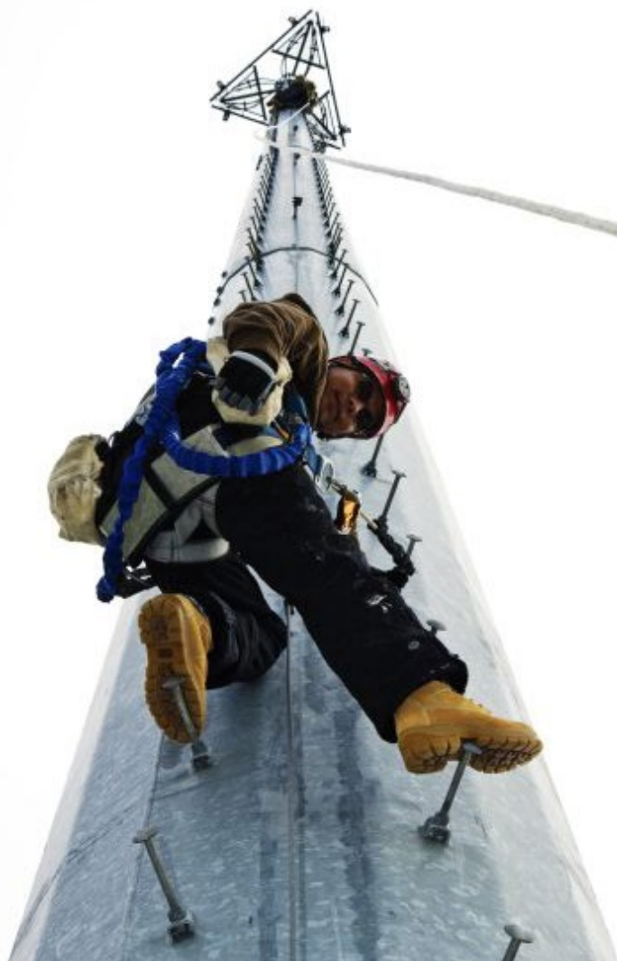
Climber starting his way up the cell tower.

"The circulators we used demonstrated some pretty awesome isolations," continues Daneshgaran. "At the frequency we operated on, we realized almost 30 dB of port-to-port isolation, which is a lot. Typically, it is very hard to even get above 20."