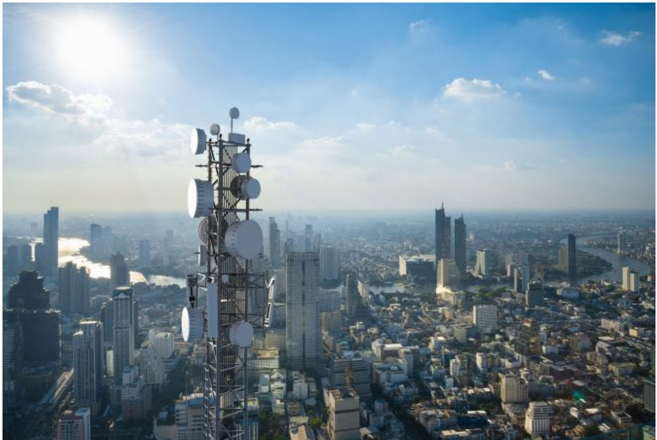
Telecommunication tower with 5G cellular network antenna.

“The only way to support the billions of users at higher data rates is to keep utilizing higher and higher frequency bands, so components are going to have to catch up,” explains Daneshgaran. “The problem is, however, as you go up the spectrum it gets harder and harder to build critical components like circulators that can operate at those frequencies.”