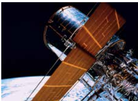
Designers are working on circulators that can be used in deep space

In radar applications, larger bandwidth makes it easier to discern a target in a given sweep. But for any application, wider bandwidths allow for more data that can be supported since the data rate is directly